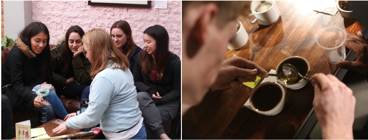
Figure 2 Sketch modeling activity between participants and community members (left). Coffee tasting activity as part of the context stage (right).