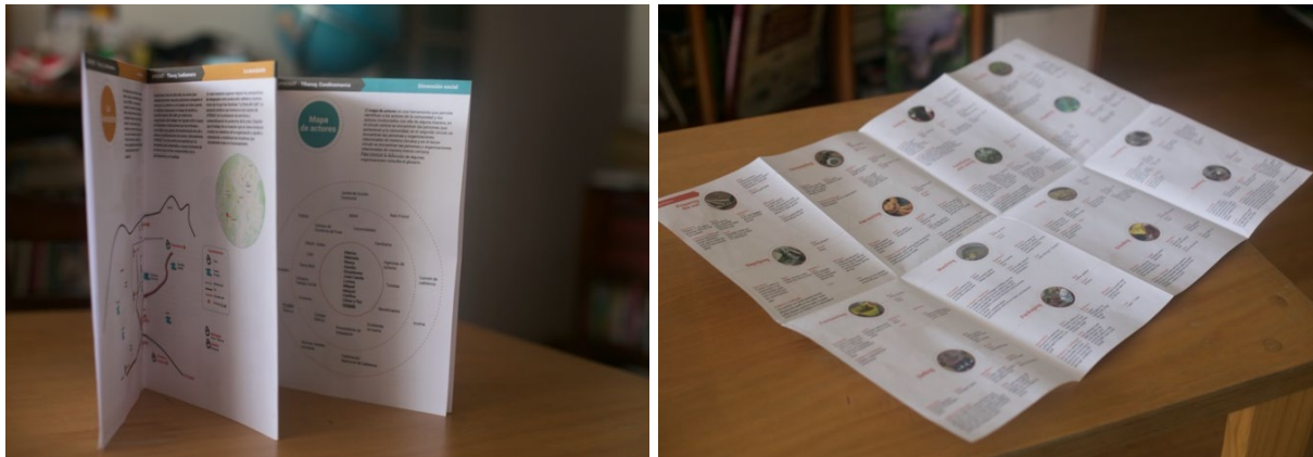
Figure 1 Foldable materials created for participants. Each foldable included cartographic information for each farm, stakeholder analysis, empathy maps, value canvas, and brief overview of the organization (left). The foldable also included a comprehensive visualization of the coffee production process for each farm (right).

involved, as well as the relationships and human networks surrounding the coffee process using Empathy Maps, Stakeholder Maps (Tschimmel, 2012), and Value Canvas (Atasoy et al., 2013) tools among others (Figure 1). The course adopted the notion of *coffee farms as design labs* as a way of de-centering white-coat labs as sites of knowledge production. In the sub-sections below, we further articulate the 3 learning pillars of the course: (1) Background and Context, (2) Co-Design Immersion, and (3) Co-Production.