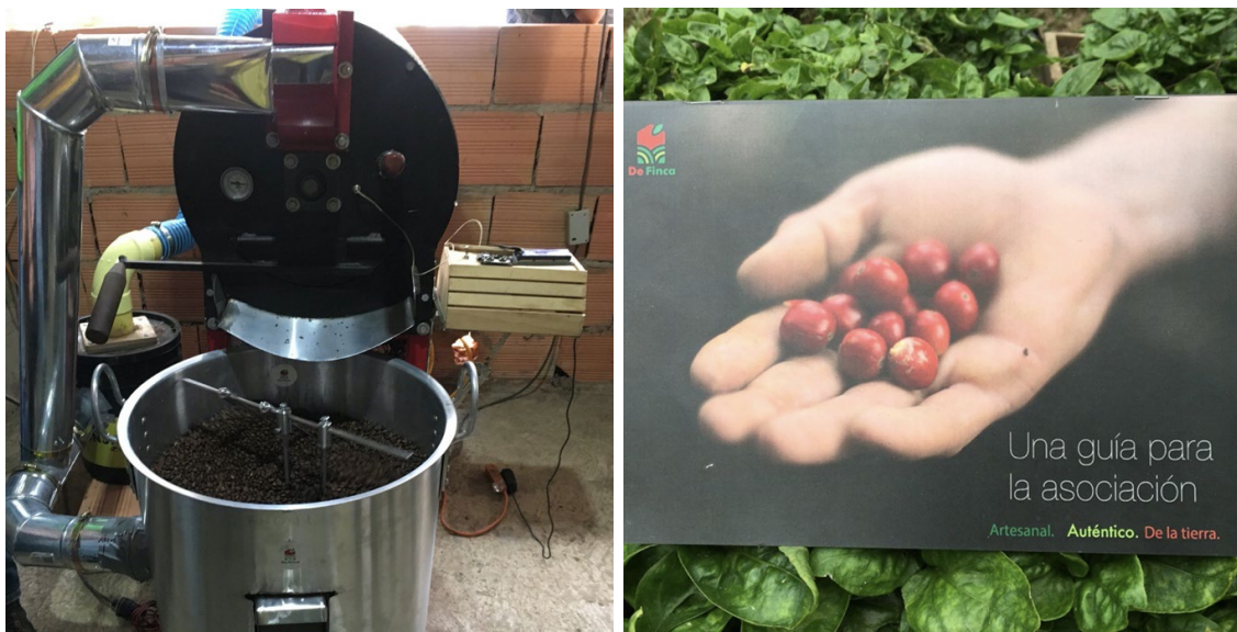
Figure 4 Selection of projects developed with the DeFinca community. Low-cost coffee roaster with smoke extraction and coffee bean cooling systems integrated (left). Guide to onboarding and management of association members (right).

In the APRENAT farm, teams developed: (1) an artificial beehive and sensor kit design for beekeeping of angel bees along with a cartography for a touristic “bee route”; (2) honeycomb press for honey extraction; (3) design and prototype of mobile Point of Sale (POS) stations for the farm along with materials for branding and marketing strategy for honey products, and (4) Bamboo-based vertical garden (Figure 4).