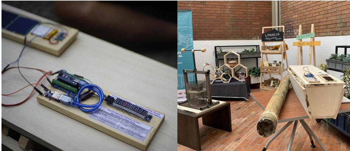
Figure 5 Selection of projects developed with the APRENAT community. From left to right, manual honeycomb press, beehive-inspired mobile POS booth, vertical mobile POS booth, bamboo-based vertical garden, sensorized angel bee beehive.