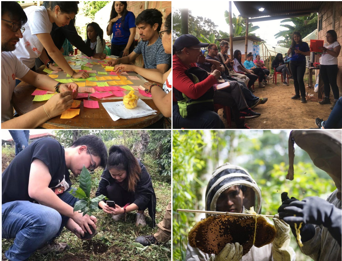
Figure 3 Clockwise from upper left. Ideation session with DeFinca community members. Concept feedback session with DeFinca community members. Coffee seedling planting. Beekeeping as a connected activity to coffee farming.

The goals for the last stage of the course were to (a) build, test, and implement the result of co-design processes developed in farms, and (b) iterate with feedback from the De Finca and APRENAT communities. Our aspiration was for participants to reflect upon the journey of getting to the prototyping stage, identify challenges throughout the process that could be corrected during the implementation phase, and wrap-up the course with identifying avenues for further work.